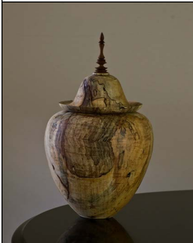
Sugar Maple Vessel. Size 13" x 6" diameter. Medium mixed woods: sugar maple with cherry finial.

Ray Sandusky is a Middle-Tennessee based photographer and wood-lathe sculptor. A variety of wood-created works from the artist's collection will be presented, with a focus on shape and form. Each sculpture is crafted from hardwoods local to the Nashville area. From the artist's statement: "When selecting wood as a medium to produce objects of art, it was natural that I gravitated toward God's greatest creation in vegetation. I admire God's artistry in creating a material that has such broad application. Each piece has its own unique character, grain pattern and form, from which I strive for revelation through the process of turning, carving and finishing." Sandusky uses only woods from trees that have fallen naturally, or which have been cleared for land use projects.