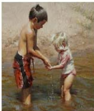
Exploring the Beach 20"x20" Oil on Panel

"You can't just paint what you see in front of you. You have to capture the emotion, hidden in a space, for the viewer to see and feel." Chuck Marshall