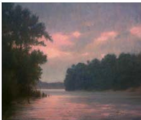
Evening Storm" 24"x30" Oil on Canvas