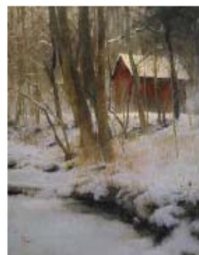
The Red Barn 28"x22" Oil on Canvas